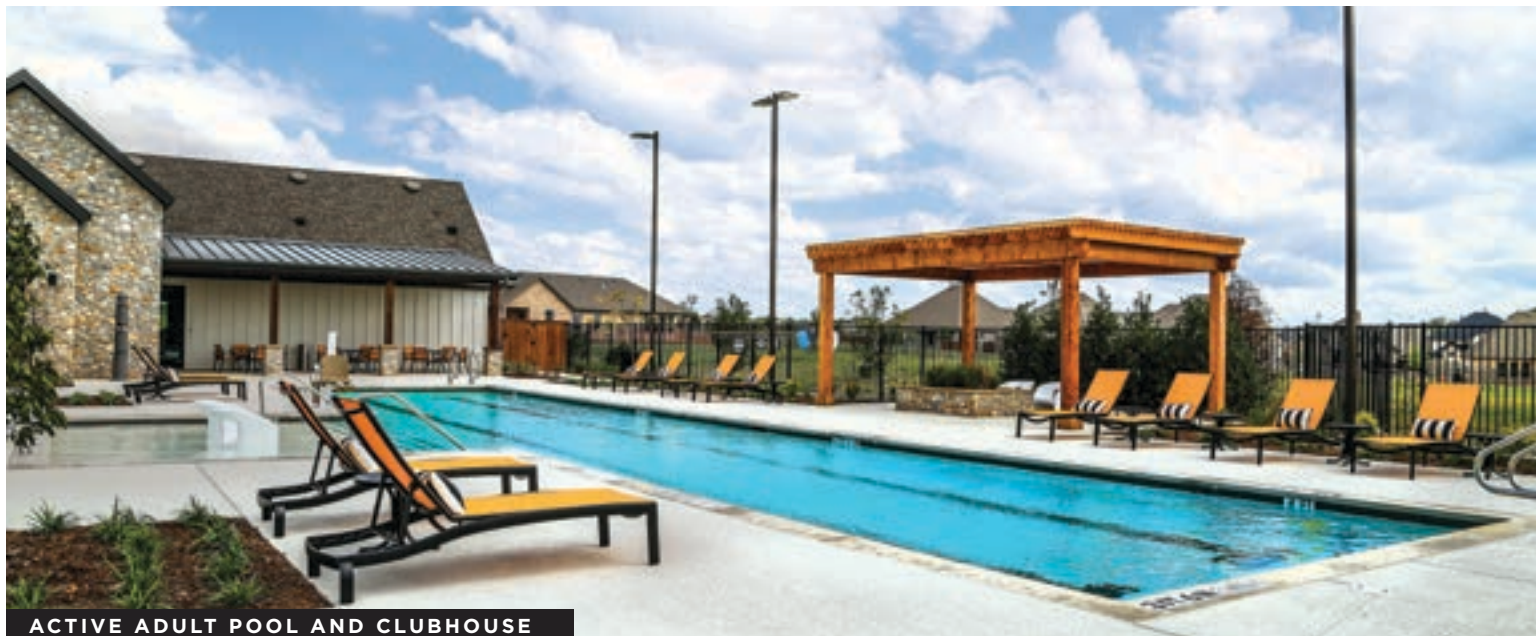
ACTIVE ADULT POOL AND CLUBHOUSE