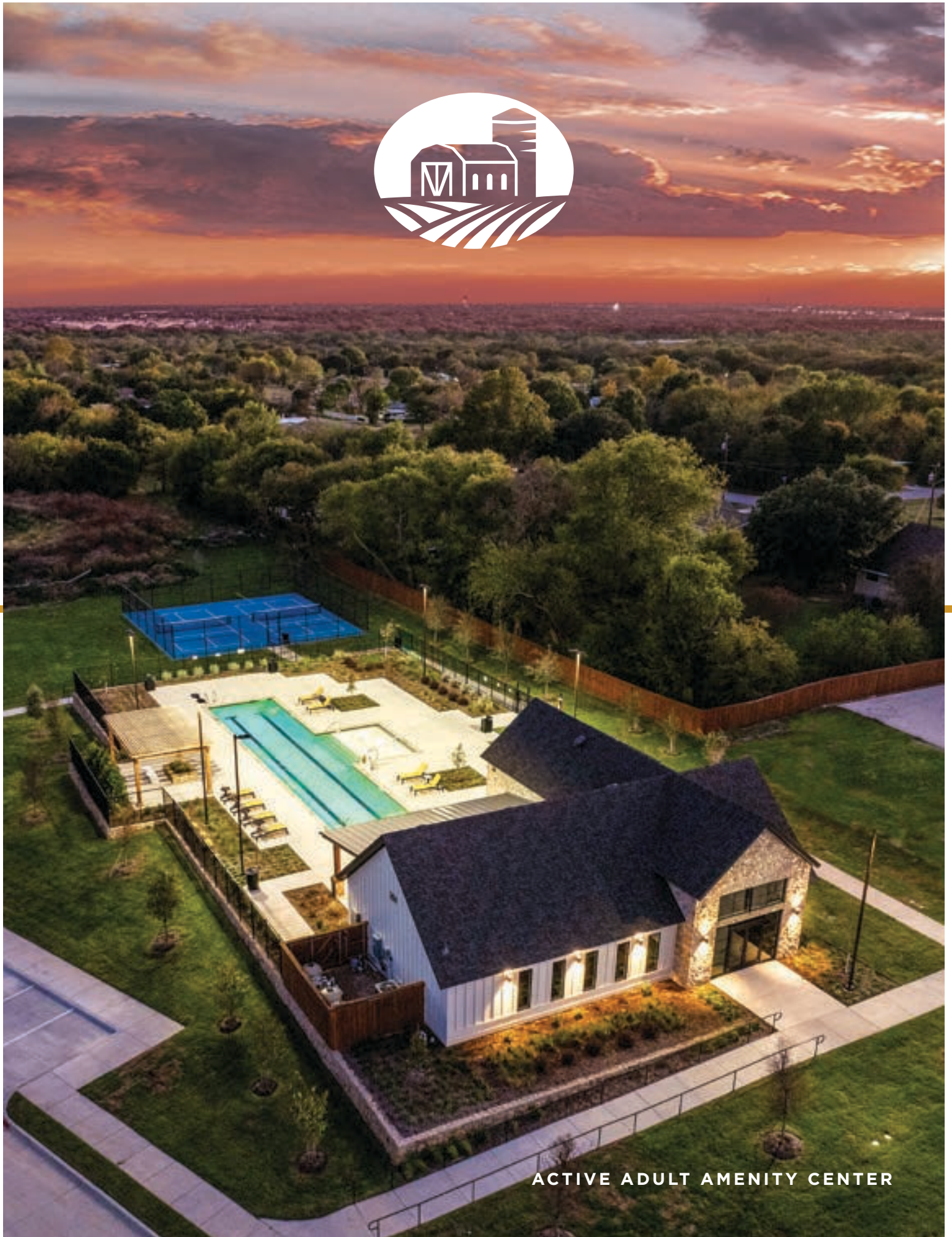
ACTIVE ADULT AMENITY CENTER