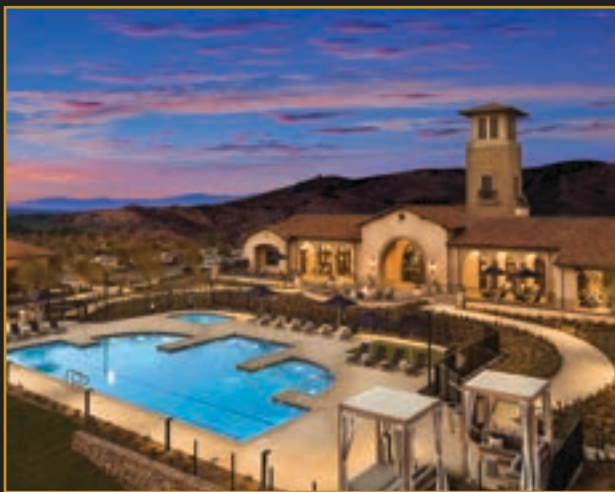
TERRAMOR – LOS ANGELES

In 2025 Starwood Land acquired 11 master-planned communities comprising more than 16,000 homesites and 600 acres of commercial property in three of the Top Ten largest U.S. new home markets – Dallas, Houston and Austin. In 2025, for the third consecutive year, Starwood Land's Sunterra in Houston is the #1 selling community in Texas.