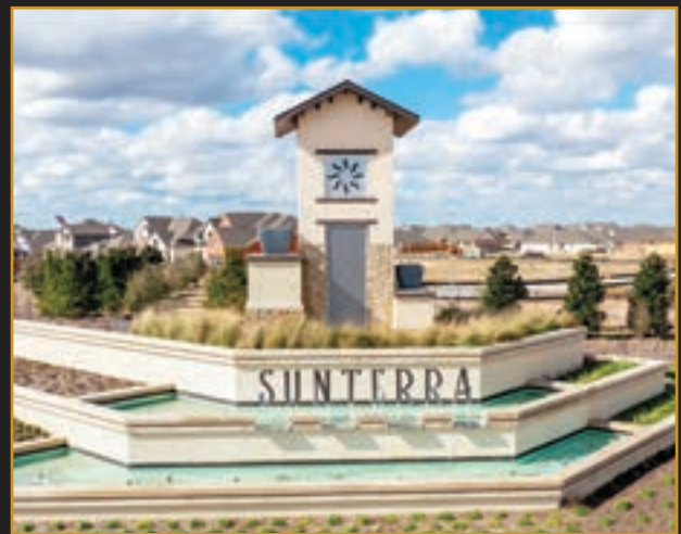
SUNTERRA – HOUSTON